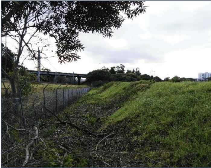
Historical stockpiles on 122 Smith Street