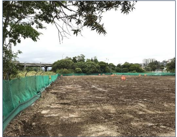
122 Smith Street following the removal of stockpiles (2018)